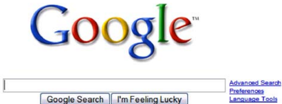
Figure 5: Search engine at www.Google.com

The best way to comb MySpace for relevant information for an investigation is to use Google.com with Boolean and advanced operators (Figure 5). You can search all of MySpace, only blogs on MySpace, or only profiles on MySpace. You can search for particular phrases, include or exclude specific words, and more. See Table 1 for methods you can employ to search MySpace.com using Google.